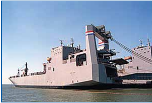
The Ready Reserve Force ship MV Cape Horn (T-AKR-5068) at berth in San Francisco, California. Cape Horn has 2 sister ships named MV Cape Hudson and MV Cape Henry , all operated by Matson Navigation Company for the U.S. government.

However, the exercise only tests an initial full-scale breakout. The MarAd expressed concerns that sealift operations would face serious crewing challenges for sustained operations. The report supports “...the conclusion that there existed enough qualified mariners to meet the demand signal at activation, likely will not reflect real-world dynamics of a very