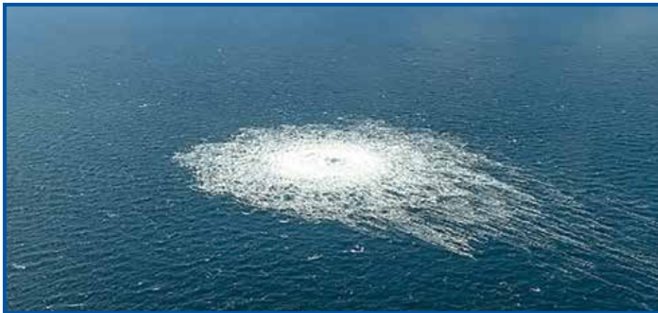
Gas bubbling at the surface off Bornholm Island in the Baltic Sea near the leak from Nord Stream 2

The report also noted that an actual breakout nearly coincided with this exercise when seven ships were activated for Turbo Activation 22-1. During this Turbo Activation, several ROS and FOS crewmembers tested positive for COVID-19 on board, and two ships failed to meet the five-day ROS to FOS period, due in-part, to crew availability related to COVID-19. “As evident during Turbo Activation 22-1, mariners testing positive for COVID-19 will almost certainly impact the ability to activate multiple ships simultaneously,” said the report. Since the spring activity, RRF ships have been activated on missions, for shipyards and sea trials, and for no-notice activations on a continuous basis.