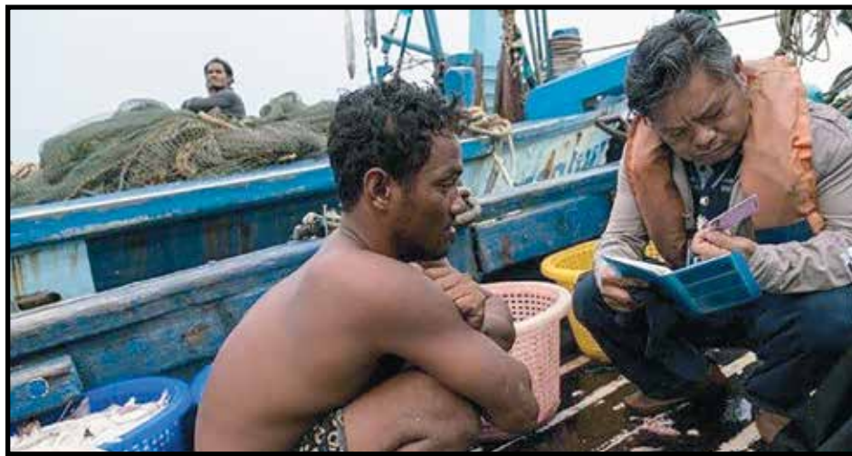
A Cambodian worker on a Thai fishing ship during an inspection in Thailand.

On boats like these, deckhands were often beaten for small transgressions, like fixing a torn net too slowly or mistakenly placing a mackerel into a bucket for sablefish. Dispatched into the unknown,