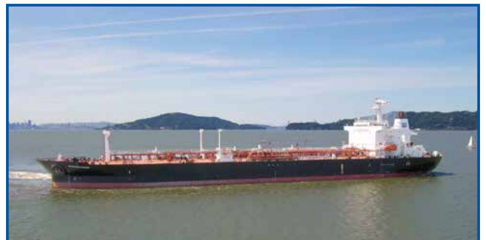
The Chevron tanker Mississippi Voyager maneuvers off Richmond Long Wharf in San Francisco Bay. Chevron’s newest tanker, the Utah Voyager is expected to soon begin trading in the West Coast Jones Act trade while the Mississippi approaches the end of a long-term charter. Meanwhile negotiations for a new contract will begin early next year. The SUP represents all unlicensed in the deck, engine and steward departments in Chevron’s U.S.-flag fleet.

The annual inflation adjustment has been awarded since 1975 under a formula legislated by Congress. Policy experts have debated whether the current formula accurately measures the inflation that affects retirees, but there’s little disagreement on the COLA’s importance in helping beneficiaries keep up with costs.