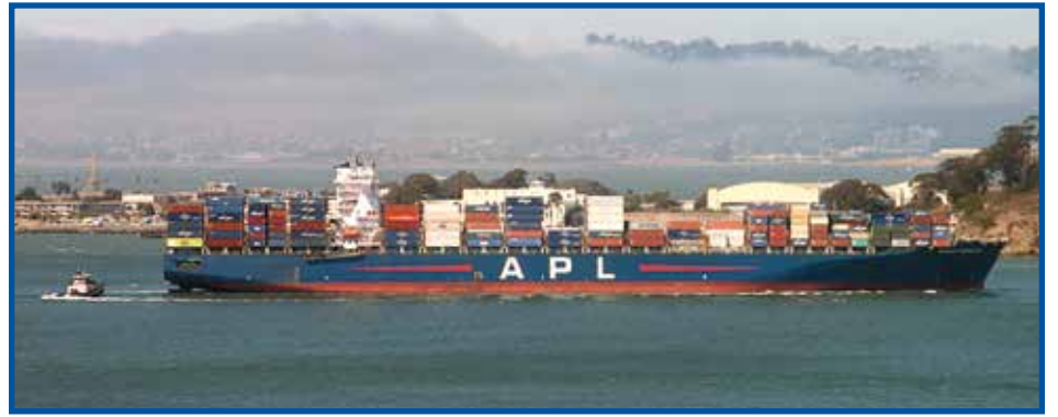
The APL containership President Eisenhower inbound from sea off Treasure Island in San Francisco Bay.

Pension Plan improvements include an increase in the maximum monthly benefit of $125 with corresponding pro-rata increases for lower levels of service. It also includes a cost-of-living adjustment of 2% for eligible pensioners currently in pay status who retired at age 55 or older with 20 or more years of qualifying service.