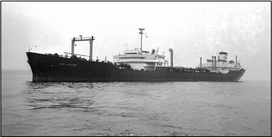
Then, Esso Jamestown, above: Launched in 1957 the Esso Jamestown was the latest in oil tankers, designated a T-2 class it was built in Newport News, VA. 39,124 DWT, 685' long and 93' beam with a capacity of approximately 240k barrels, with a steam turbine and single propeller and was capable of 18 knots. Now, Liberty Bay, below: The Liberty Bay launched in November 2013, is the latest in oil tanker vessels built in Aker Philadelphia Shipyard in Philadelphia, PA. At 115,000 DWT, its 823' long with a 143' beam, it can carry 800k barrels of crude. State of the art electronics, MAN B&W diesel power plant and one propeller it can reach speeds of 15 knots. The Liberty Bay and her sister ship, the Eagle Bay provide an optimistic future for the ESU and the membership for years to come.