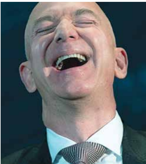
BEZOS LAUGHING: in his last letter to shareholders, billionaire Jeff Bezos, admitted after the vote that Amazon could be a better employer. He leads the race to become world’s first trillionaire.

The RWDSU immediately called out some of Amazon’s tactics as illegal. For example, a drop box that was placed in the parking lot of the facility could have intimidated workers into thinking that Amazon was monitoring the vote and was a direct effort to influence the ballot. Others have pointed to Amazon’s push to have the county change the timing of a traffic light leaving the warehouse