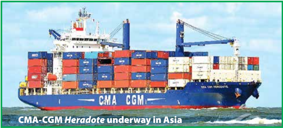
CMA-CGM Heradote underway in Asia

members be shipped off the hiring hall deck as per past practice. The Quarterly Finance Committee will turn-to on Monday, May 10 at 0800.